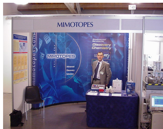
An example of possible booth set-up